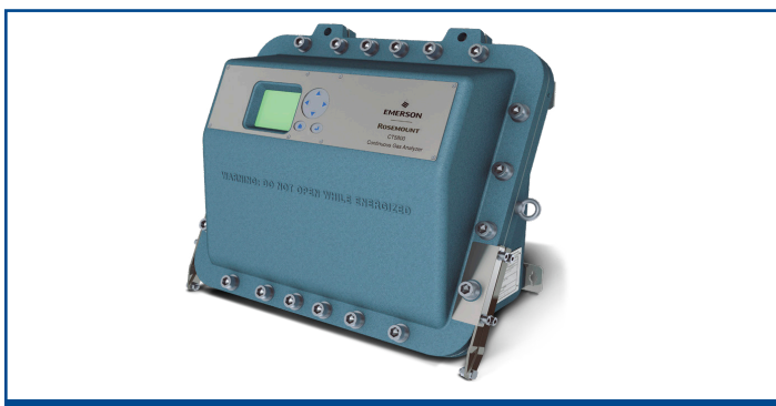
Rosemount CT5800 Continuous Gas Analyzer

* Repeatability is ± 1% of reading or the Limit of Detection (LOD), whichever is greater. Other ranges are available. Please consult an Emerson application specialist