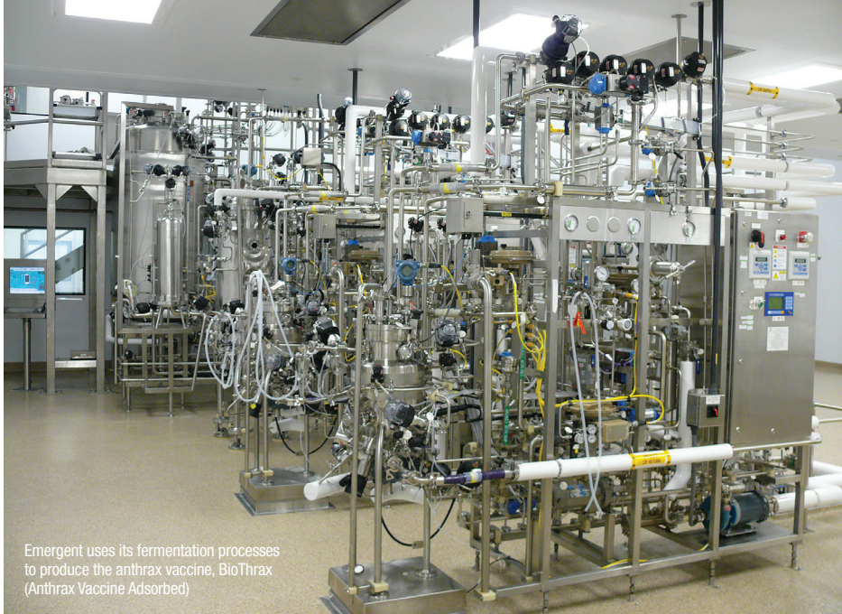
Emergent uses its fermentation processes to produce the anthrax vaccine, BioThrax (Anthrax Vaccine Adsorbed)