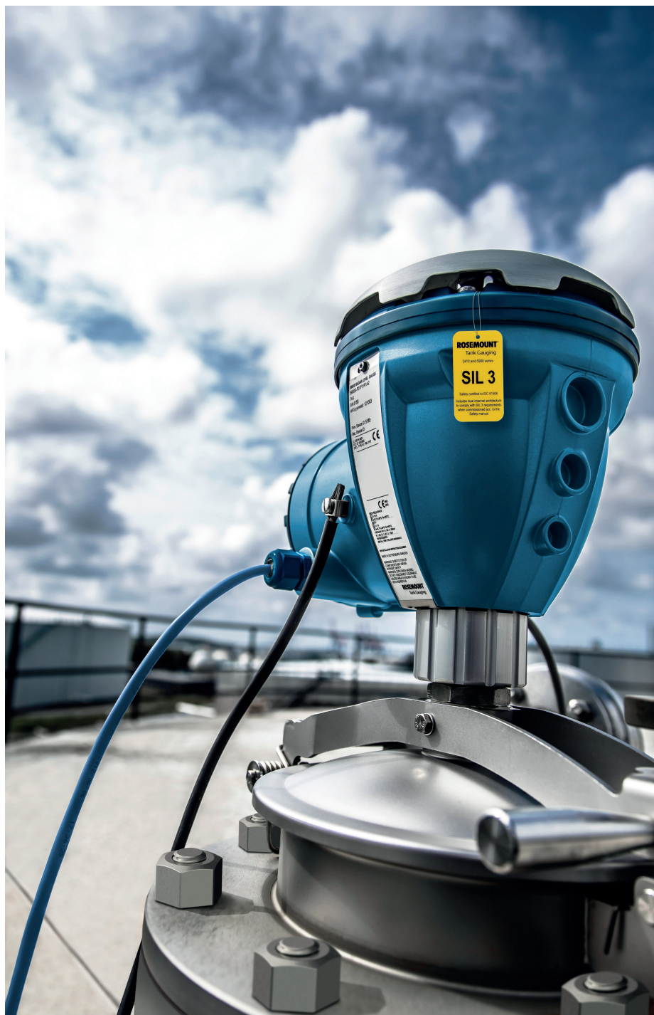
Rosemount 5900 Series gauges can be installed on existing tank openings using the same cabling and communication protocol as the previous devices, which makes the replacement of old gauges relatively quick and easy

Those owners unwilling to either fully or partially upgrade their tank gauging systems have had to simply make do with their mechanical float or servo gauges, replacing them like-for-like when necessary and accepting the limited functionality and high maintenance costs these devices incur. However, this too is not straightforward, as some older mechanical gauges are