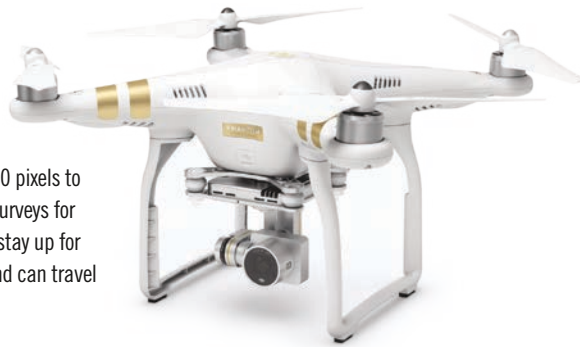
Figure 2: MR Systems uses its Phantom 3 quad-copter 4K camera with 1,920 x 1,080 pixels to fly at less than 300-400 feet and conduct surveys for wireless/radio installations. The drone can stay up for about 30 minutes on one battery charge, and can travel at up to 50 mph.

located, Jason Schexnayder, sales director for the ecom division of Pepperl+Fuchs ( www.pepperl-fuchs.com ), reports it recently launched the world's first explosion-proof tablet PC approved for use in Zone 1/Div. 1 and Zone 2/Div. 2 settings. Developed in cooperation with Samsung, Tab-Ex 01 can retrieve data in real time, interact with remote experts and backend systems, and use optional cameras to capture and respond to maintenance errors and other issues.