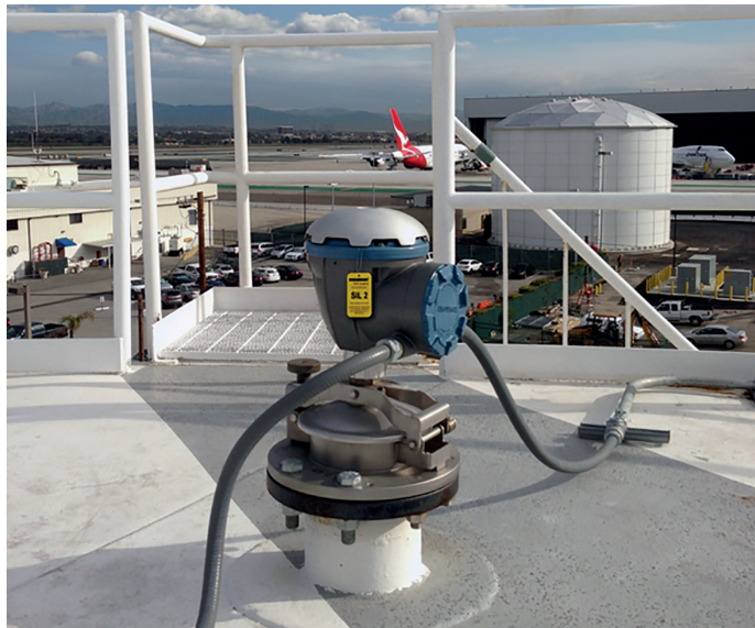
Figure 2: Modern radar level gauges can be installed in existing tank nozzles and interface with existing management systems

Adding new wired instruments is the traditional method for creating a new measurement point, however wireless instruments are a convenient alternative. Emulation and wireless make it practical to upgrade a system incrementally, bit by bit as the situation demands, or as funds are available. It is not necessary to launch a large-scale CAPEX project to fix everything at once.