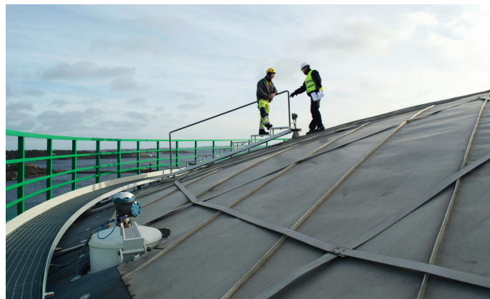
Figure 3: Partner with a trusted advisor knowing your business

Adopt a lifecycle strategy developed in partnership with the right kind of supplier. Working with a company capable of providing the right products and ongoing support creates a high degree of reliability and system performance.