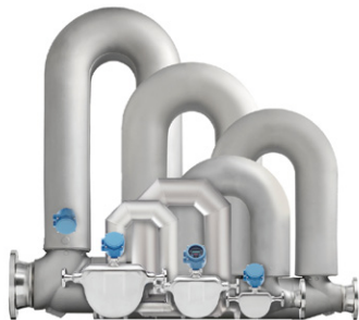
Micro Motion ELITE® Coriolis Flow and Density Meters

For complete product specifications, visit www.emersonprocess.com in the Products link or contact your sales representative.