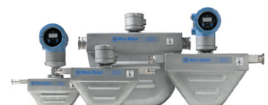
Micro Motion R-Series Coriolis Meters