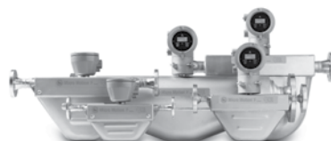
Micro Motion F-Series Coriolis Meters