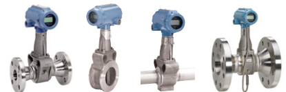
Rosemount® 8800 Vortex Flowmeters