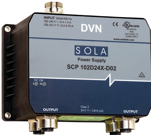
Dual 100 Watt Model