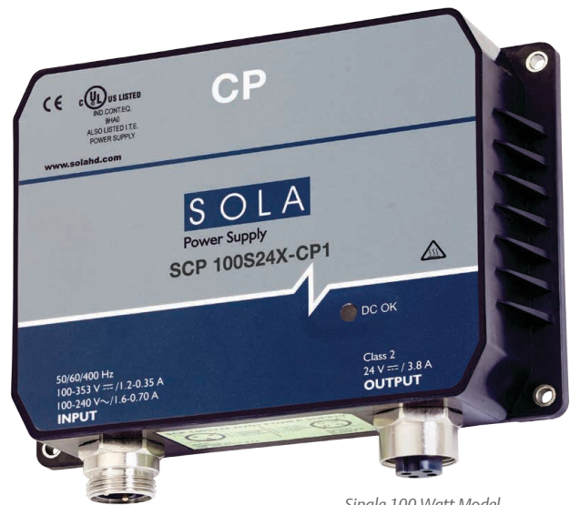
Single 100 Watt Model