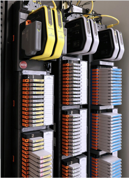
DeltaV Electronic Marshalling.