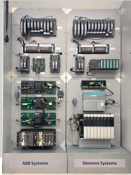
Solutions for ABB Bailey and Siemens Systems.