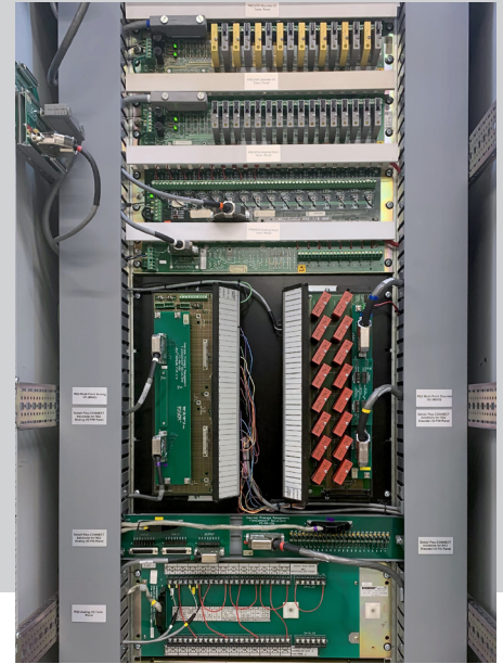
Wiring Solutions for PROVOX™ and RS3™ Systems.