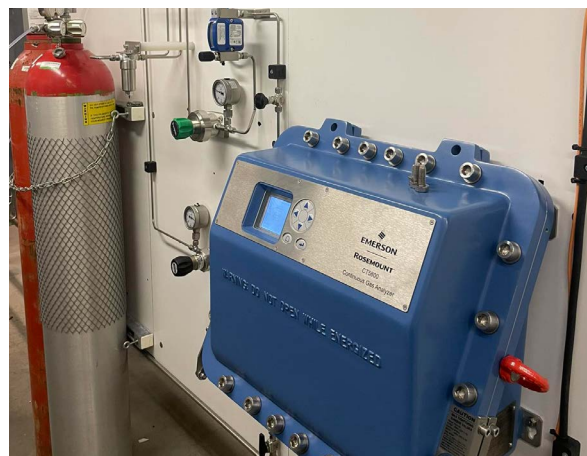
Figure 1: BASF used Emerson's Rosemount™ CT5800 Continuous Gas Analyzer for real-time analysis of multiple gas components, ensuring ethylene product quality and eliminating the need to deploy multiple analyzers.

This fast, online detection—coupled with a high degree of measurement accuracy—helps BASF meet its needs for product certification and delivery. The company was able to