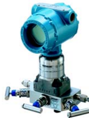
Rosemount 3051S Pressure Transmitter

The accuracy and stability of the Rosemount 3051S helped this refinery reduce the crude pre-heater process variability, improve flame stability, and reduce the rate of coking in the heater tubes.