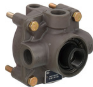
MU1-RGS high-flow pressure regulator from AVENTICS.

Emerson Automation Solutions 1953 Mercer Road Lexington, KY 40511 + 1 859-254-8031 us.AVENTICS@Emerson.com