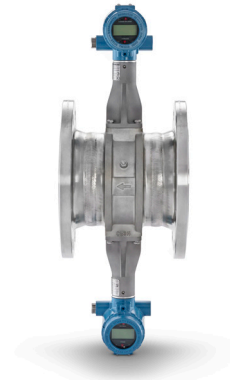
Rosemount 8800 Dual Vortex

Emerson Automation Solutions Industries Emerson.com/Refinery