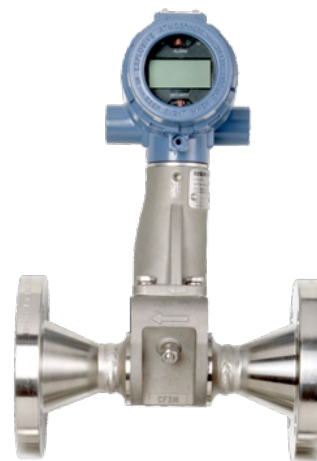
Rosemount 8800 Reducer Vortex

“The Rosemount 8800 Vortex flow meter was selected to significantly improve the safety and confidence of the measurement point while reducing the costs associated with installation and maintenance.”