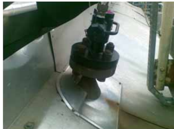
Claus Recovery unit with a Rosemount Application and Industry Solution (AIS) Sapphire Temperature Sensor

Since the sapphire sensor lasted longer, it resulted in more accurate temperature monitoring, enabling MOL Danube Refinery to meet their target sulfur recovery content and further increase tail gas quality. The burner is now running longer on its optimum temperature resulting to better energy use, leading to improve process efficiency. And with the sapphire sensor still working for over 12 months, maintenance does not need to do replacement of failed sensors during process shutdown, which was common in the past. This allowed them to save on maintenance cost. Having this positive test outcome, MOL Danube Refinery is planning to implement the solution to its other recovery units with the same expected improvement and savings.