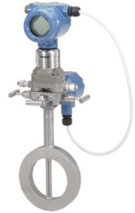
Rosemount Compact Annubar Flow Meter