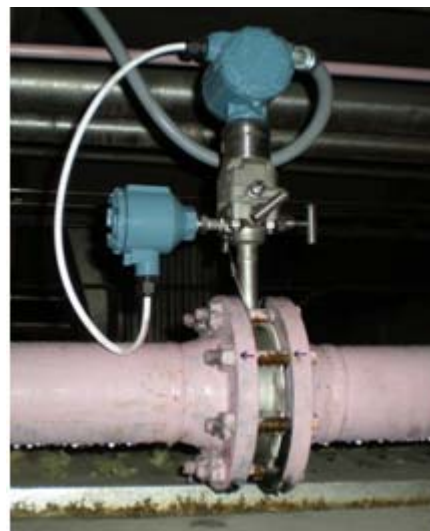
Rosemount Compact Annubar Flow Meter installation between two raised face flanges

A more accurate billing was achieved using the Rosemount™ Compact Annubar™ Flow Meter.