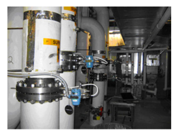
Figure 1. Conditioning Orifice Mass Flow Meter (1595 conditioning orifice plate with 3095 multivariable transmitter)

With the improved performance and low pressure loss from the Conditioning Orifice Meter, the air handling units now were able to deliver the full-range capacity for an increased process efficiency.