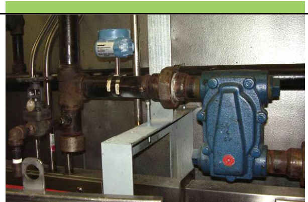
The Rosemount 708 Wireless Acoustic Transmitter features integrated sensors that mount externally to make installation fast, inexpensive, and non-intrusive to the process.

"We found 22% of our traps needed to be replaced during our last PM check. By installing wireless acoustic transmitters, the plant will prevent steam loss with early detection of steam trap failure. Not only will this minimize energy loss, but it will free up maintenance to focus their time and attention on things that need to be fixed, to further improve our productivity," concluded the customer.