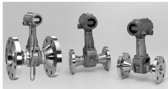
The Rosemount 8800 Vortex Flowmeter Series

Petro-chemical plant reduces maintenance costs by $1,080 per point annually by using Rosemount 8800 Vortex Flowmeters.