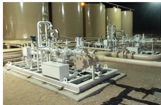
Lease Automatic Custody Transfer (LACT) unit

Micro Motion Inc. USA Worldwide Headquarters 7070 Winchester Circle Boulder, Colorado USA 80301 T +1 303-527-5200 T +1 800-522-6277 F +1 303-530-8459 www.Emerson.com