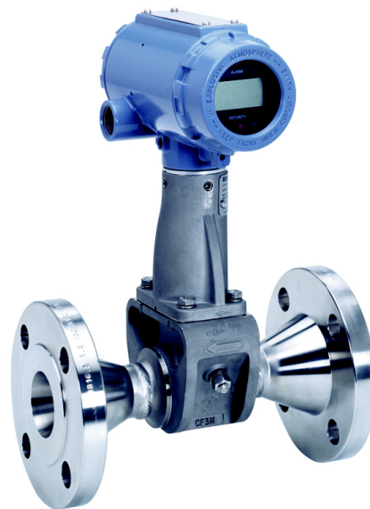
The 8800 Reducer™ Vortex Flowmeter