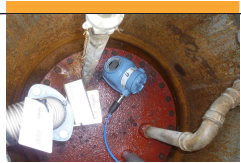
Rosemount 5300 mounted on an underground tank with limited head-space and connection possibilities. Pipe-work extends into the tank.

Rosemount 5300 Level Transmitter Emerson.com/Rosemount5300