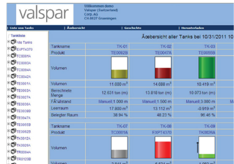
After the installation: inventory is automatically monitored. Precise measurement data is published in both German and English on the local intranet.