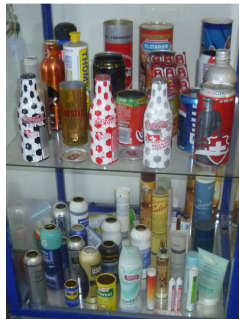
This particular site in Grüningen Switzerland, is an entity that mainly produces coatings for rigid packaging, particularly for tubes, monoblocs, food and beverage cans.

The level measurement needs to be completely automatic, with the resulting inventory data made available on the web for everyone connected to Valspar's intranet – also for the local branch office in the UK. The steel tanks were located underground, with limited head-space and connection possibilities.