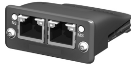
Active - (Industrial Ethernet)