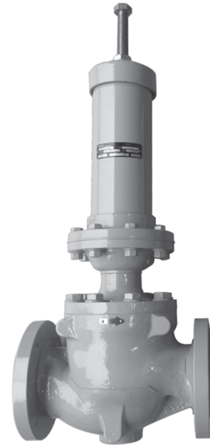
Figure 1. Type CT88 Backpressure Regulator

See Figure 2. Type CT88 direct-operated backpressure regulator responds to changes in inlet pressure. Inlet pressure is registered on the underside of the diaphragm through an external sensing line that is connected to the lower diaphragm casing.