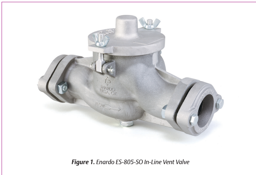
Figure 1. Enardo ES-805-SO In-Line Vent Valve