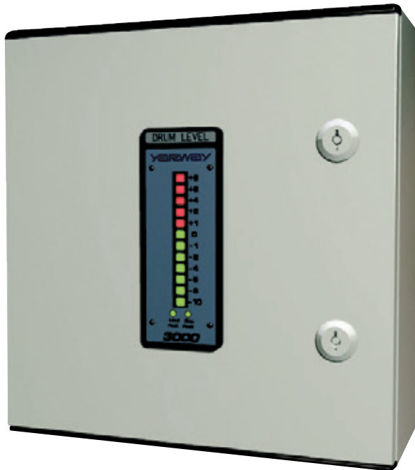
Shown with optional red/green LED door mounted display

An advanced, multi-featured five probe and above electronic alarm system for sensing water level in a variety of high or low pressure applications