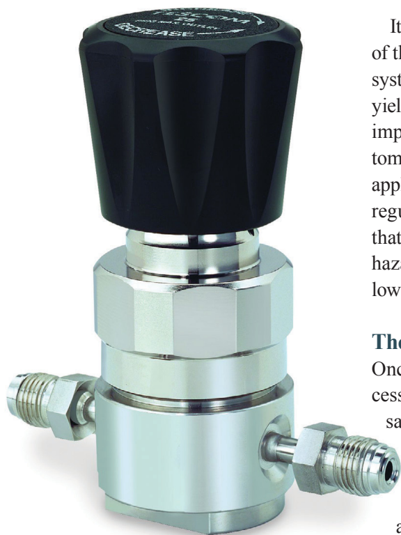
Figure 3. High-purity regulators, like Emerson's TESCO™ 64-2600 Series Electropolished Pressure Regulator, are used for semiconductor applications that require high cleanliness rates, low leakage and precise pressure control.

preventive maintenance of gas cabinet systems. This is an area where highly corrosive gases can be found and corrosion can lead to leaks. Any kind of leakage from a gas cabinet system can contaminate the whole system. By integrating sensors in a gas cabinet system, the sensors can measure specified parameters, such as excess flow, and the software that sensors feed this data can predict or determine the early stages of a leak.