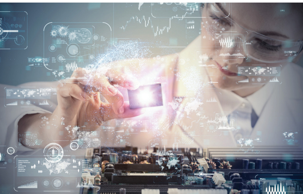
Figure 1. Digitalization makes it possible for human operators to have a conversation with their machinery, providing real-time insight into manufacturing processes.

In a fab, those terms translate this way: Personnel may still manually check pressure ranges using a pressure gauge and clipboard. This is analog information. Replacing that pressure gauge with a sensor that transmits pressure range information into a computer is digitization. If the collected information just remains as data points, it won't mean anything, but if that information is translated into a story about the process that operators can use to make decisions, that's digitalization. For example, slow changes in pressure typically aren't noticed using analog information until wafer quality or productivity levels change. Through digitalization, operators can see minute pressure changes as deviations from the baseline and quickly address them before they impact quality or production.