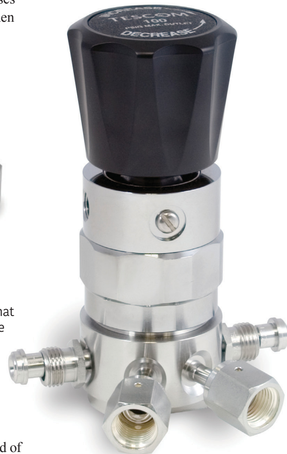
Figure 5. Gas cabinet systems depend on the precise control that regulators, like Emerson's TESCO 64-2800 Series Electropolished Pressure Regulator in 4-port option, provide to store hazardous media safely and efficiently for use within semiconductor manufacturing systems.

While a digital twin isn't always necessary, it's one of the most popular digital transformation solutions