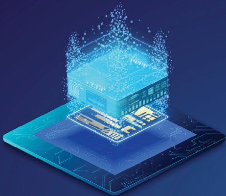
Figure 2. The digital transformation of semiconductor wafer fabrication can ensure transparency, precision and accuracy in each step of the manufacturing process, improving efficiency and productivity.

When all processes within a fab have been digitalized, it has been digitally transformed.