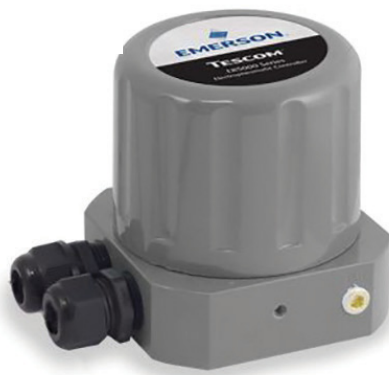
Figure 4. Emerson's ER5000 Series Electropneumatic Actuator is a microprocessor-based proportional, integral, derivative (PID) controller that provides precise algorithmic pressure control and, when connected to any pneumatically actuated regulator, can help fabs move toward automation.

Once all wafer manufacturing processes have been digitalized, a fab can say that it has undergone complete digital transformation. At this stage, human operators take on a supervisory role and all processes are performed by a computer. When