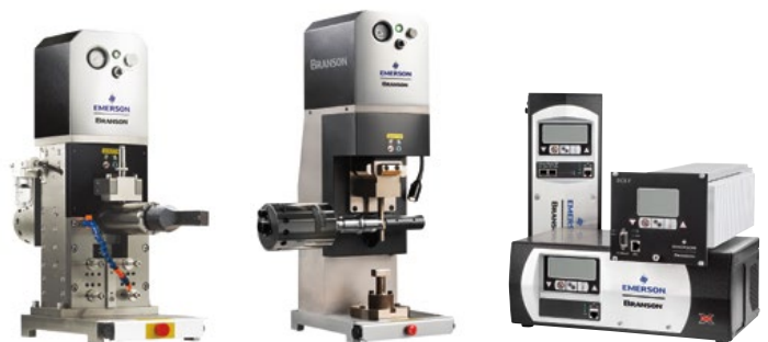
Full Range of Branson Ultrasonic Metal Welding Equipment

BRANSON ™ For more information visit Emerson.com/Branson