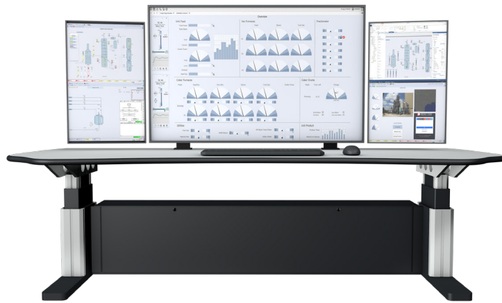
DeltaV Live Updates For All Version 14 Releases