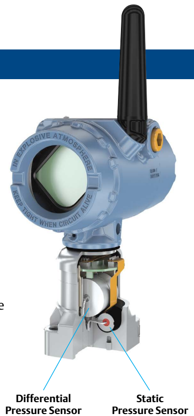
Differential Pressure Sensor

Fouling of tubes reduces efficiency and increases energy usage and cost. The Rosemount 3051S MultiVariable Wireless Pressure Transmitter provides early detection of fouling so you can schedule maintenance proactively.