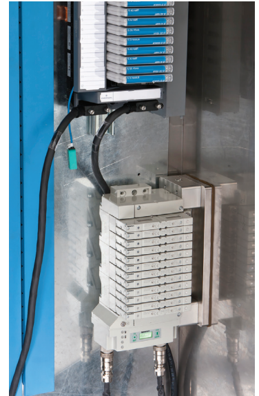
Example: Valve systems connected to intrinsically safe I/O baseplate