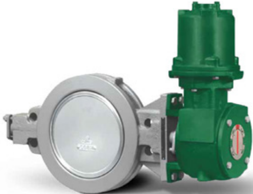
Fisher DSV Valve and 1061 Actuator