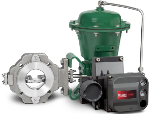
Fisher 8580 Valve and 2052 Actuator