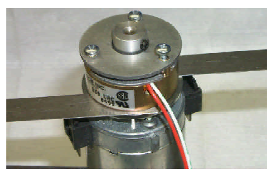
300 Series, DC Brake Assembly