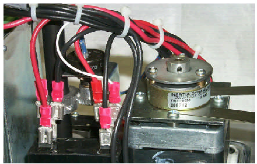
300 Series, AC Brake Assembly