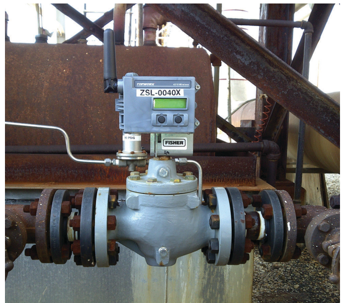
Fisher Type EZR with Topworx Type 4310 Wireless Position Monitor

The Emerson solution lowered the facility upgrade an estimated $60k by eliminating the need to run over 2,000 feet of conduit and wire.