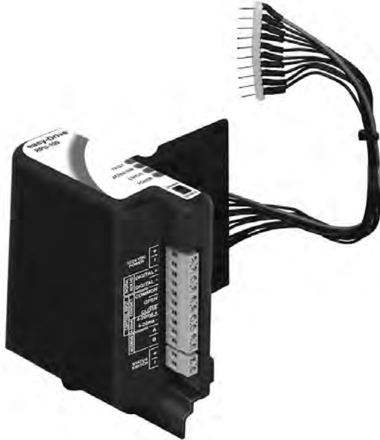
Figure 2. Fisher RPU-100 with Wiring Harness

Designed for use in Fisher easy-Drive actuators, the RPU-100 provides energy for positioning the actuator to the user-defined location on loss of incoming power. Reference the easy-Drive RPU-100 Instruction Manual ( D104551X012 ).