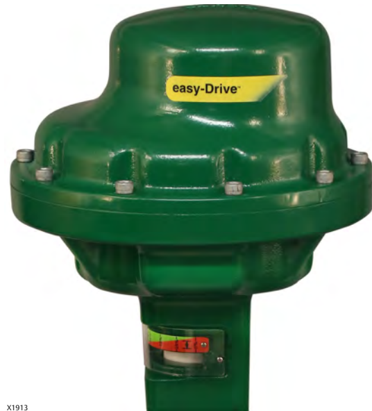
Fisher easy-Drive 200R

The Fisher easy-Drive 200R is a rugged electric actuator designed for use on rotary-shaft valve bodies in throttling or on/off applications. The actuator can be controlled via Modbus RTU, 4-20mA, or dry contact signals. Set up and calibration is performed with the Fisher easy-Drive Configurator software, which provides one button calibration. The actuator is designed to provide dependable on-off or throttling operation of control valves.