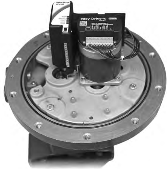
Figure 3. Fisher easy-Drive 200R Actuator with RPU-100