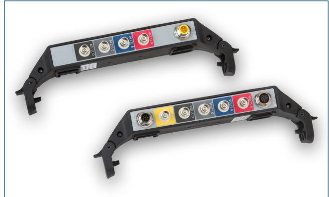
The adapter offers accelerometer inputs on one side, volts inputs on the other.