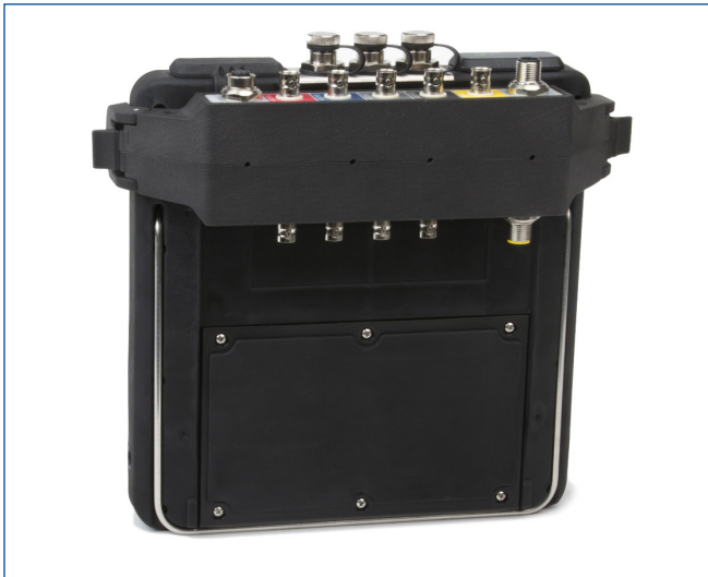
The four-channel adapter snaps easily to either side of the analyzer itself. The padded shoulder strap attaches to the outside of the adapter.

The four-channel accessories kit includes everything you need to unlock the power of the AMS 2140 four-channel analyzer. Simultaneously collect four-channel acceleration data for rolling element bearings, or four-channel volts data for sleeve bearings from a single input adapter by simply turning it over and using the appropriate side. The adapter is simple to install with a simple tab-click installation on both sides of the analyzer. The kit includes the 4-channel input adapter, cables, accelerometers, and magnets necessary to perform most any kind of 4-channel analysis.