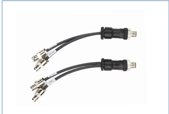
Splitter cables included in the four-channel accessory kit are another way to collect four-channel simultaneous measurements.

Emerson Reliability Solutions 835 Innovation Drive Knoxville, TN 37932 USA ☎ +1 865 675 2400