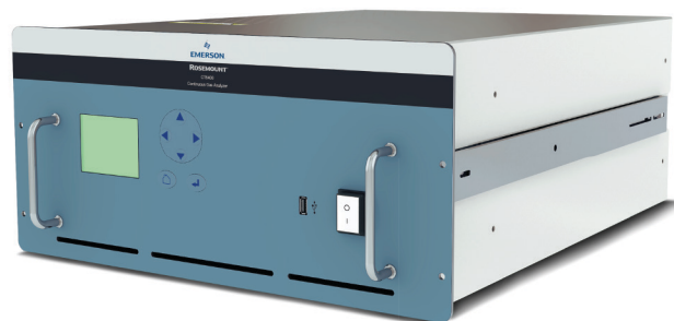
Rosemount™ CT5400 Continuous Gas Analyzer