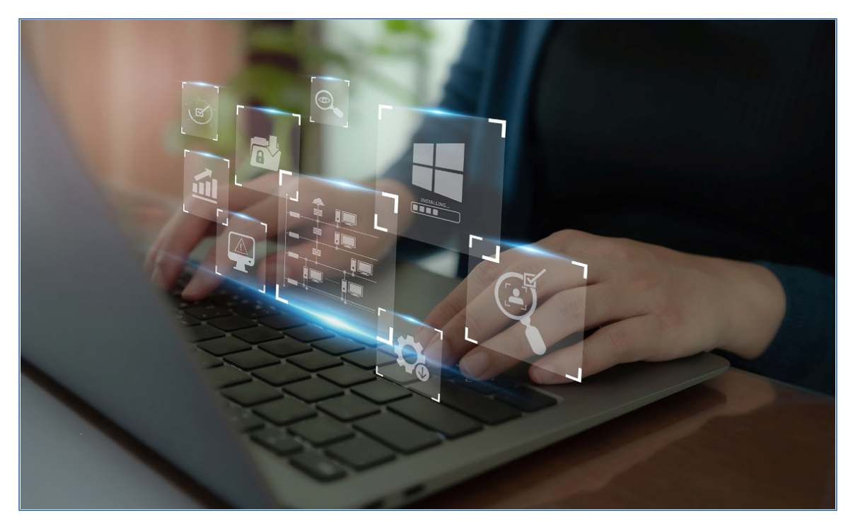
Keep your DCS updated with the latest patches, hotfixes, and antivirus definitions with Emerson's DeltaV <sup>™</sup> Integrated Patch Management.