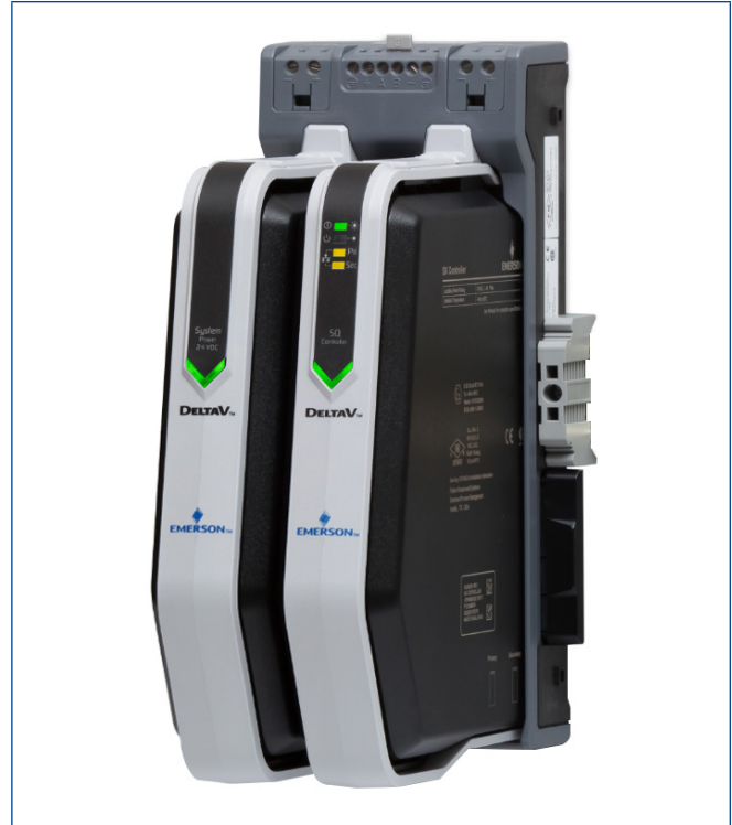
The SQ Controller.

Designed for Electronic Marshalling. The SQ Controller have highly distributable I/O capabilities with CHARMS based Electronic Marshalling. Electronic Marshalling I/O can be mounted anywhere, facilitating system design and expansion while reducing overall system footprint over traditional marshalled I/O Subsystems.