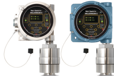
M21 (SS & AL) shown with SX3 Series Sensors

English, French, Portuguese, or Spanish display languages included. The full text menu makes installation, operation, and calibration simple. No manual necessary!