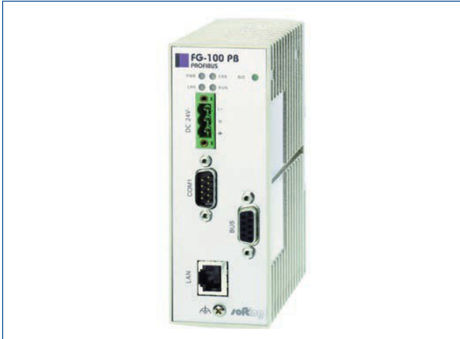
Use the Softing linking devices listed below to connect AMS Device Manager to PROFIBUS segments on third party hosts.