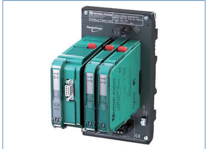
Use Pepperl + Fuchs PROFIBUS segment coupler to connect AMS Device Manager to PROFIBUS PA devices on DeltaV™ systems or third party hosts.