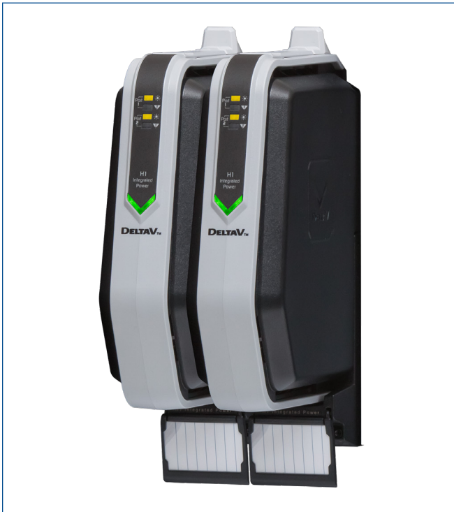
Redundant S-series H1 interface with integrated power.

Segment power supplies are integrated into this H1 card, greatly simplifying installation design, reducing footprint and improving segment diagnostics. The terminal block includes a fixed segment terminator, eliminating external wiring to fieldbus power supplies and their terminators. Redundant H1 cards provide redundant power to the segments for increased availability.