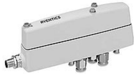
AVENTICS CL03-EV valves regulate cylinder movements of the Forma4 machine and are installed directly on the consumer.

This makes the Forma4 turning device a sensible investment—especially considering that about 3 million wheels of Parmigiano-Reggiano and approximately 5 million wheels of Grana Padano cheese are produced in their region of origin each year.