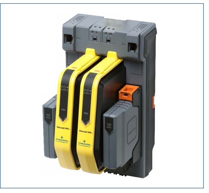
Functional Safety Maintenance and Proof Testing for continued safety integrity and operation in accordance with the IEC 61511 Safety Life Cycle.