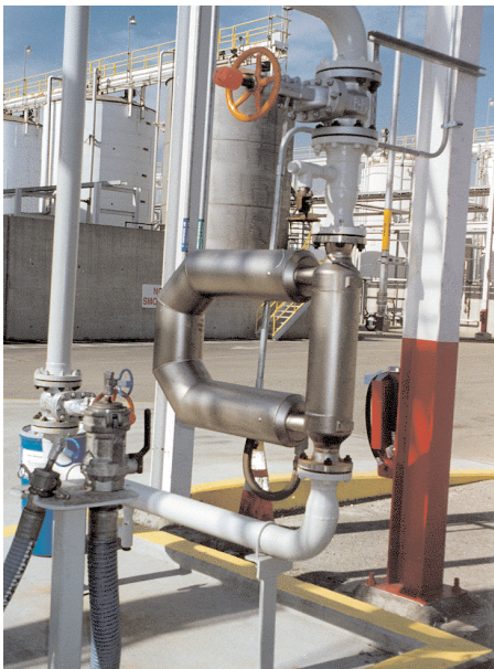
Truck loading with a 3" Micro Motion Elite® meter

Performance of Micro Motion® meters in these applications has improved (with patented features like transient bubble remediation) over the past several years and research continues to make further improvements.